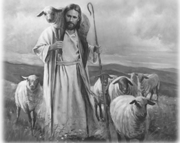
"Good Shepherd" by Del Parson ( www.delparson.com )